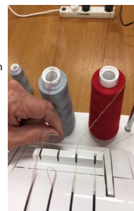
Step 2: then pull loop through the pre-tension guide to release the thread.

Stitch Selector: D Stitch Length: 2.0 Stitch Width: 7.5 Needle: Right Differential Feed: N